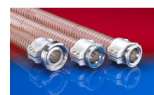
CONNECT SAFETY CLAMP ASSEMBLY 231