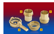
CONNECT TANK TRUCK BRASS 252