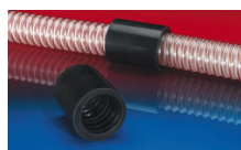
CONNECT 246 AS