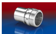
CONNECT THREAD FITTING 234