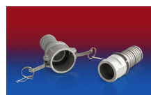
CONNECT KAMLOK ALU 253