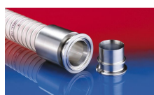
CONNECT PRESS ASSEMBLY 232