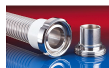
CONNECT MOULD ASSEMBLY 233