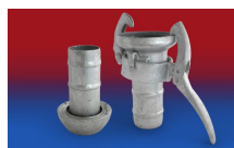
CONNECT KARDAN 254