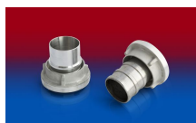
CONNECT STORZ DIN ALU 251